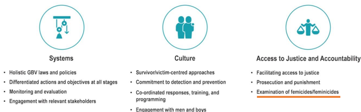
Figure 1. Three pillar approach to a Whole-of-State framework for GBV (From OECD (2021) Eliminating Gender-based Violence. Governance and Survivor/Victim-centred Approaches . page 18.)

In his 2023 report on the use and application of United Nations standards and norms in crime prevention and criminal justice, the Secretary-General recommended that Member States should strengthen multi-disciplinary and coordinated crime prevention and criminal justice